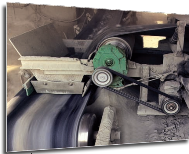
→ Belt conveyor drive